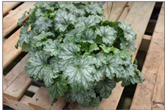
Paris Coral Bells foliage