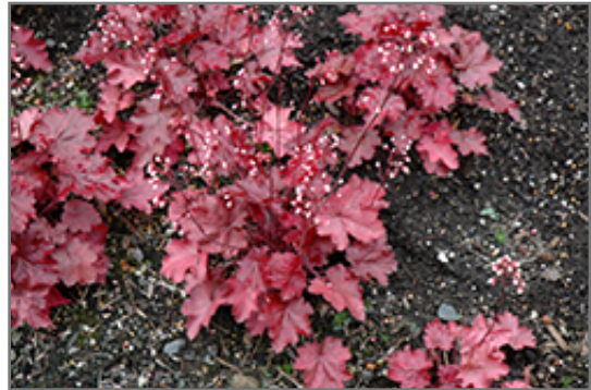
Fire Chief Coral Bells