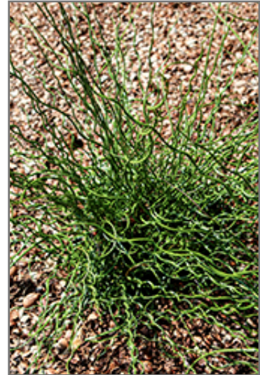
Curly Wurly Corkscrew Rush