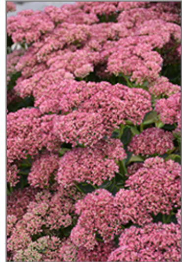
Autumn Fire Stonecrop flowers

This is a relatively low maintenance plant, and is best cleaned up in early spring before it resumes active growth for the season. It is a good choice for attracting bees and butterflies to your yard, but is not particularly attractive to deer who tend to leave it alone in favor of tastier treats. It has no significant negative characteristics.