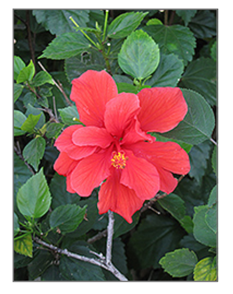
Anderson's Double Red Hibiscus flowers

When grown indoors, Anderson's Double Red Hibiscus can be expected to grow to be about 4 feet tall at maturity, with a spread of 3 feet. It grows at a fast rate, and under ideal conditions can be expected to live for approximately 5 years. This houseplant will do well in a location that gets either direct or indirect sunlight, although it will usually require a more brightly-lit environment than what artificial indoor lighting alone can provide. It requires an evenly moist well-drained soil for optimal growth, but will suffer if left to grow in standing water. The surface of the soil shouldn't be allowed to dry out completely, and so you should expect to water this plant once and possibly even twice each week. Be aware that your particular watering schedule may vary depending on its location in the room, the pot size, plant size and other conditions; if in doubt, ask one of our experts in the store for advice. It will benefit from a regular feeding with a general-purpose fertilizer with every second or third watering. It is not particular as to soil pH, but grows best in rich soil. Contact the store for specific recommendations on pre-mixed potting soil for this plant.