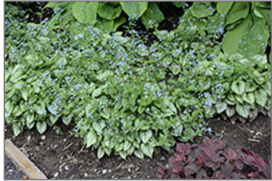
Jack Frost Bugloss in bloom

Jack Frost Bugloss will grow to be about 12 inches tall at maturity extending to 16 inches tall with the flowers, with a spread of 18 inches. When grown in masses or used as a bedding plant, individual plants should be spaced approximately 14 inches apart. It grows at a medium rate, and under ideal conditions can be expected to live for approximately 10 years. As an herbaceous perennial, this plant will usually die back to the crown each winter, and will regrow from the base each spring. Be careful not to disturb the crown in late winter when it may not be readily seen!