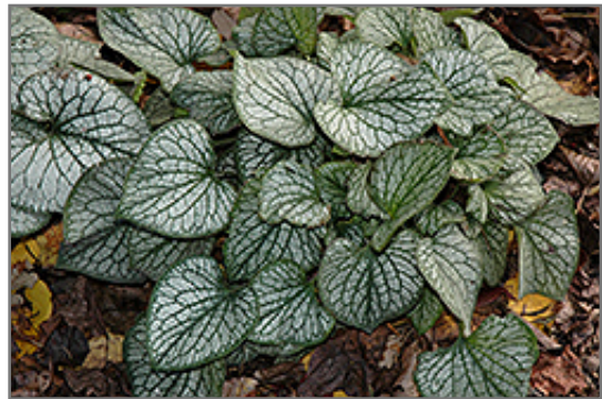
Jack Frost Bugloss foliage