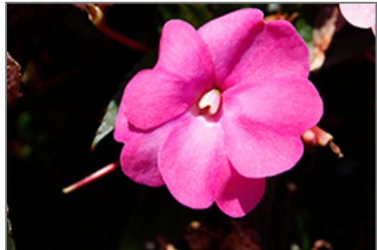
SunPatiens Compact Hot Pink New Guinea Impatiens flowers

SunPatiens Compact Hot Pink New Guinea Impatiens is recommended for the following landscape applications;