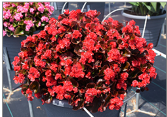
Double Up Red Begonia in bloom