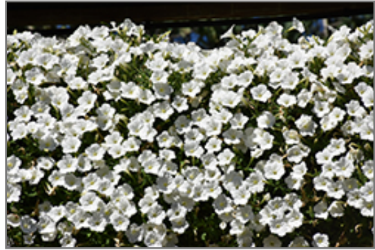
ColorRush White Petunia in bloom

ColorRush White Petunia is recommended for the following landscape applications;