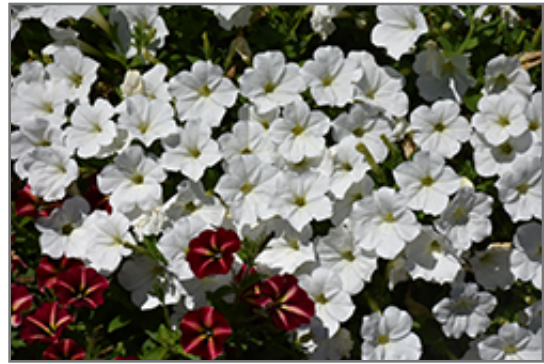
ColorRush White Petunia flowers

ColorRush White Petunia will grow to be about 12 inches tall at maturity, with a spread of 30 inches. When grown in masses or used as a bedding plant, individual plants should be spaced approximately 24 inches apart. Its foliage tends to remain dense right to the ground, not requiring facer plants in front. This fast-growing annual will normally live for one full growing season, needing replacement the following year.