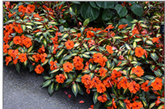
SunPatiens Vigorous Tropical Orange New Guinea Impatiens in bloom