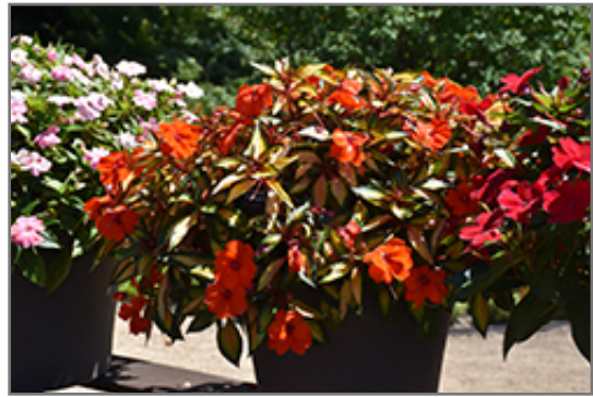
SunPatiens Vigorous Tropical Orange New Guinea Impatiens in bloom

SunPatiens Vigorous Tropical Orange New Guinea Impatiens is a fine choice for the garden, but it is also a good selection for planting in outdoor containers and hanging baskets. Because of its height, it is often used as a 'thriller' in the 'spiller-thriller-filler' container combination; plant it near the center of the pot, surrounded by smaller plants and those that spill over the edges. It is even sizeable enough that it can be grown alone in a suitable container. Note that when growing plants in outdoor containers and baskets, they may require more frequent waterings than they would in the yard or garden.