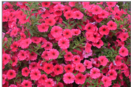
Supertunia Vista Paradise Petunia flowers