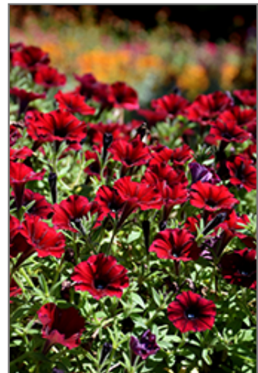
Supertunia Black Cherry Petunia flowers