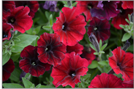
Supertunia Black Cherry Petunia flowers