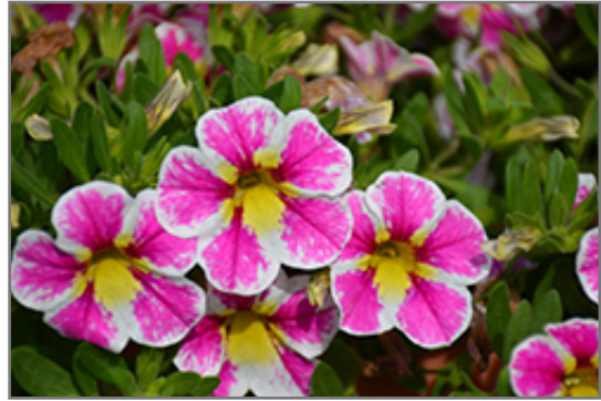
Superbells Holy Cow! Calibrachoa flowers