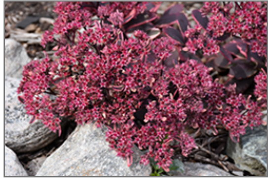
Dream Dazzler Stonecrop flowers