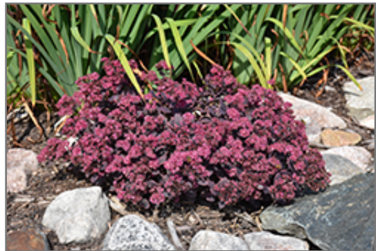
Dream Dazzler Stonecrop in bloom