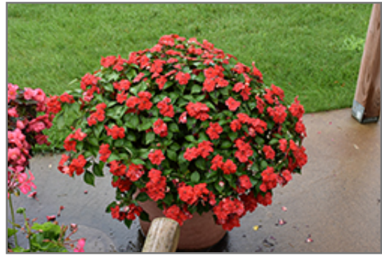
Beacon Bright Red Impatiens flowers

Beacon Bright Red Impatiens is recommended for the following landscape applications;