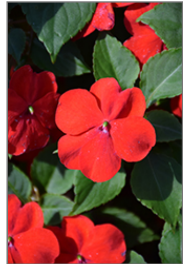
Beacon Bright Red Impatiens flowers