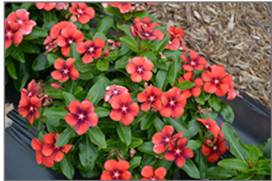
Tattoo Tangerine Vinca in bloom