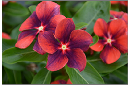
Tattoo Tangerine Vinca flowers

This plant will require occasional maintenance and upkeep, and should not require much pruning, except when necessary, such as to remove dieback. It is a good choice for attracting butterflies to your yard, but is not particularly attractive to deer who tend to leave it alone in favor of tastier treats. It has no significant negative characteristics.