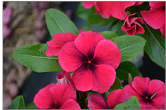
Tattoo Black Cherry Vinca flowers

This plant will require occasional maintenance and upkeep, and should not require much pruning, except when necessary, such as to remove dieback. It is a good choice for attracting butterflies to your yard, but is not particularly attractive to deer who tend to leave it alone in favor of tastier treats. It has no significant negative characteristics.