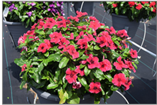
Tattoo Black Cherry Vinca in bloom

Tattoo Black Cherry Vinca is a fine choice for the garden, but it is also a good selection for planting in outdoor containers and hanging baskets. It is often used as a 'filler' in the 'spiller-thriller-filler' container combination, providing a mass of flowers against which the thriller plants stand out. Note that when growing plants in outdoor containers and baskets, they may require more frequent waterings than they would in the yard or garden.