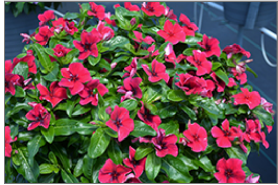
Tattoo Black Cherry Vinca in bloom

Tattoo Black Cherry Vinca is a fine choice for the garden, but it is also a good selection for planting in outdoor containers and hanging baskets. It is often used as a 'filler' in the 'spiller-thriller-filler' container combination, providing a mass of flowers against which the thriller plants stand out. Note that when growing plants in outdoor containers and baskets, they may require more frequent waterings than they would in the yard or garden.