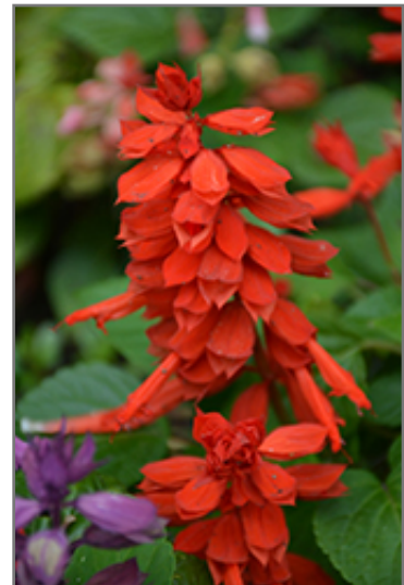
Vista Red Sage flowers