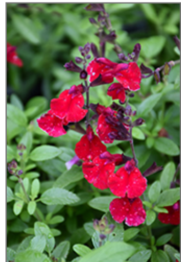
Mirage Cherry Red Autumn Sage flowers