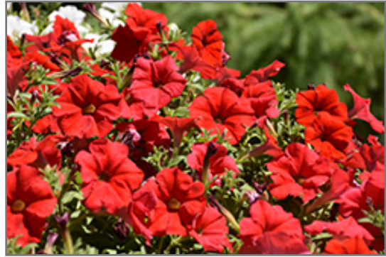
Supertunia Really Red Petunia flowers

Supertunia Really Red Petunia will grow to be about 8 inches tall at maturity, with a spread of 12 inches. When grown in masses or used as a bedding plant, individual plants should be spaced approximately 8 inches apart. Its foliage tends to remain low and dense right to the ground. This fast-growing annual will normally live for one full growing season, needing replacement the following year.