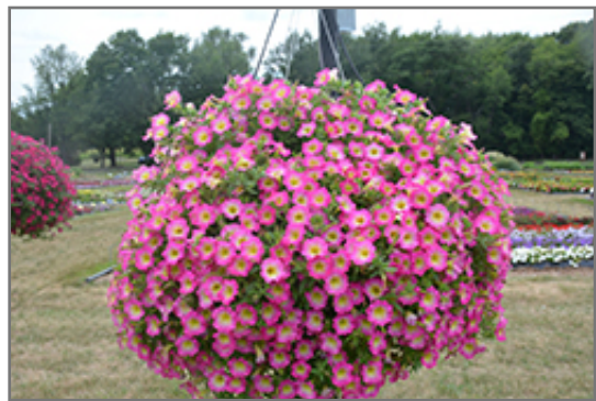
Supertunia Daybreak Charm Petunia in bloom