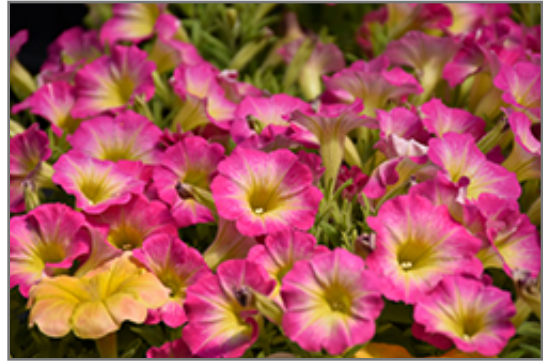
Supertunia Daybreak Charm Petunia flowers