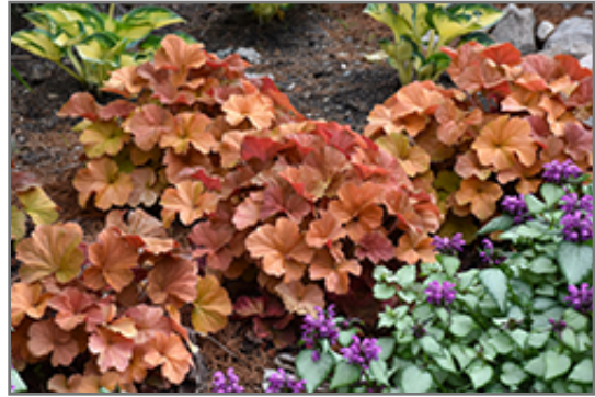
Northern Exposure Amber Coral Bells

This is a relatively low maintenance plant, and should be cut back in late fall in preparation for winter. It is a good choice for attracting butterflies to your yard. It has no significant negative characteristics.