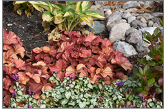
Northern Exposure Amber Coral Bells

Northern Exposure Amber Coral Bells will grow to be about 14 inches tall at maturity, with a spread of 20 inches. When grown in masses or used as a bedding plant, individual plants should be spaced approximately 16 inches apart. Its foliage tends to remain dense right to the ground, not requiring facer plants in front. It grows at a medium rate, and under ideal conditions can be expected to live for approximately 10 years. As an evergreen perennial, this plant will typically keep its form and foliage year-round.