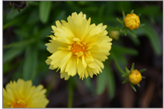
Leading Lady Charlize Tickseed flowers

Leading Lady Charlize Tickseed is recommended for the following landscape applications;