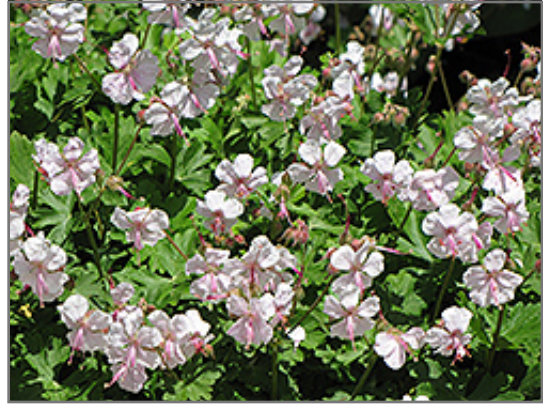
Biokovo Cranesbill in bloom

Biokovo Cranesbill will grow to be about 8 inches tall at maturity, with a spread of 18 inches. When grown in masses or used as a bedding plant, individual plants should be spaced approximately 15 inches apart. Its foliage tends to remain low and dense right to the ground. It grows at a medium rate, and under ideal conditions can be expected to live for approximately 10 years. As an evergreen perennial, this plant will typically keep its form and foliage year-round.