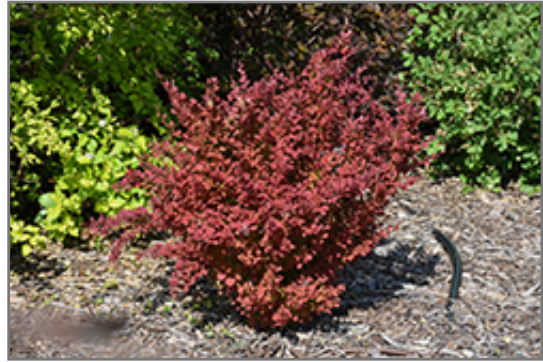
First Editions Toscana Barberry

First Editions Toscana Barberry is recommended for the following landscape applications;