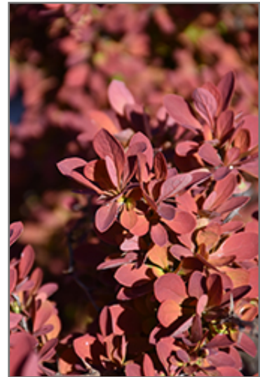
First Editions Toscana Barberry foliage