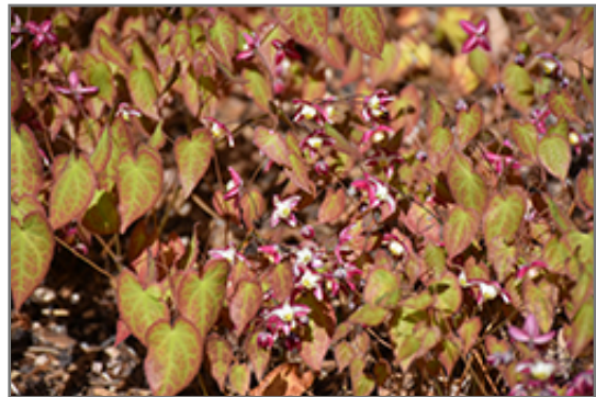
Bishop's Hat in bloom