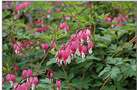
Common Bleeding Heart flowers

Common Bleeding Heart is recommended for the following landscape applications;