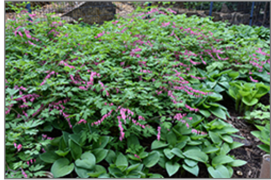
Common Bleeding Heart in bloom

Common Bleeding Heart will grow to be about 3 feet tall at maturity, with a spread of 3 feet. When grown in masses or used as a bedding plant, individual plants should be spaced approximately 30 inches apart. It grows at a medium rate, and under ideal conditions can be expected to live for approximately 15 years. As an herbaceous perennial, this plant will usually die back to the crown each winter, and will regrow from the base each spring. Be careful not to disturb the crown in late winter when it may not be readily seen! As this plant tends to go dormant in summer, it is best interplanted with late-season bloomers to hide the dying foliage.