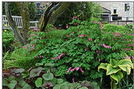
Common Bleeding Heart in bloom