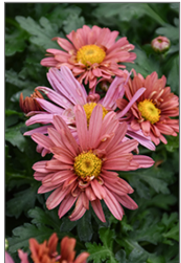
Coral Daisy Chrysanthemum flowers