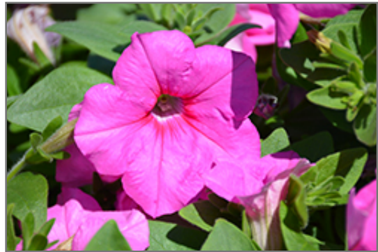
Easy Wave Pink Passion Petunia flowers

Easy Wave Pink Passion Petunia is recommended for the following landscape applications;