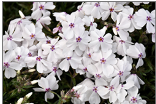
Amazing Grace Moss Phlox flowers