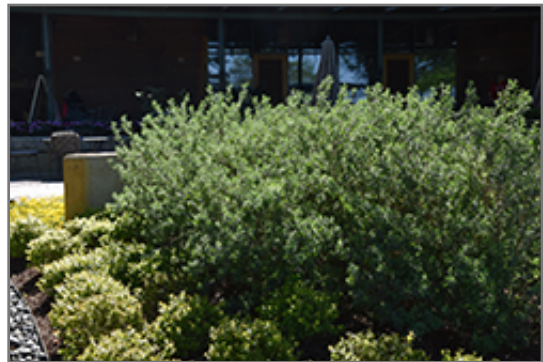
Texas Sage