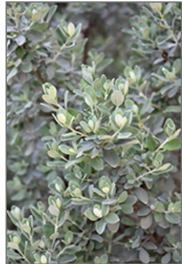
Texas Sage foliage

Texas Sage makes a fine choice for the outdoor landscape, but it is also well-suited for use in outdoor pots and containers. With its upright habit of growth, it is best suited for use as a 'thriller' in the 'spiller-thriller-filler' container combination; plant it near the center of the pot, surrounded by smaller plants and those that spill over the edges. It is even sizeable enough that it can be grown alone in a suitable container. Note that when grown in a container, it may not perform exactly as indicated on the tag - this is to be expected. Also note that when growing plants in outdoor containers and baskets, they may require more frequent waterings than they would in the yard or garden. Be aware that in our climate, most plants cannot be expected to survive the winter if left in containers outdoors, and this plant is no exception. Contact our experts for more information on how to protect it over the winter months.