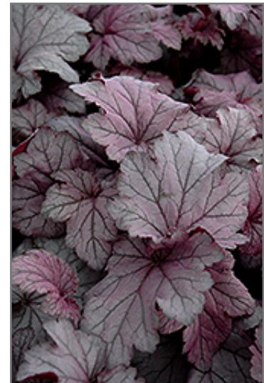
Spellbound Coral Bells foliage