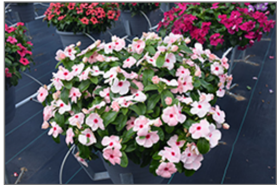
Titan Apricot Vinca in bloom