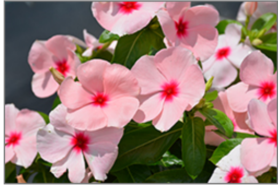
Titan Apricot Vinca flowers

Titan Apricot Vinca is recommended for the following landscape applications;