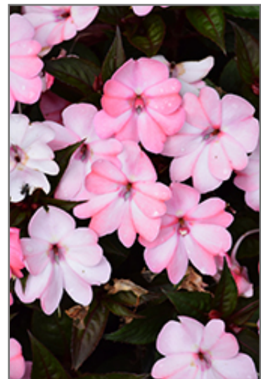
SunPatiens Compact Blush Pink New Guinea Impatiens flowers