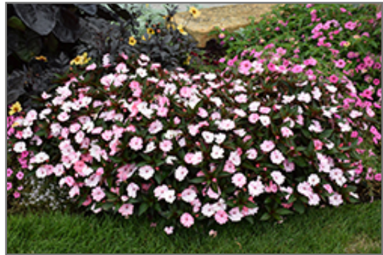
SunPatiens Compact Blush Pink New Guinea Impatiens in bloom

This plant will require occasional maintenance and upkeep, and should not require much pruning, except when necessary, such as to remove dieback. It has no significant negative characteristics.