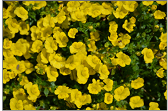
Gold Dust Mecardonia flowers

Gold Dust Mecardonia will grow to be only 4 inches tall at maturity, with a spread of 15 inches. When grown in masses or used as a bedding plant, individual plants should be spaced approximately 12 inches apart. Its foliage tends to remain low and dense right to the ground. Although it's not a true annual, this fast-growing plant can be expected to behave as an annual in our climate if left outdoors over the winter, usually needing replacement the following year. As such, gardeners should take into consideration that it will perform differently than it would in its native habitat.