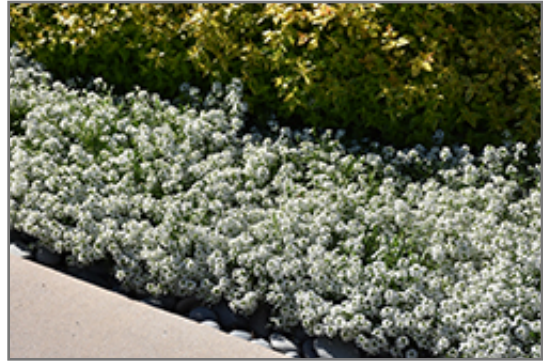
Snow Princess Alyssum in bloom

Snow Princess Alyssum will grow to be about 8 inches tall at maturity, with a spread of 24 inches. When grown in masses or used as a bedding plant, individual plants should be spaced approximately 20 inches apart. Its foliage tends to remain low and dense right to the ground. This fast-growing annual will normally live for one full growing season, needing replacement the following year.