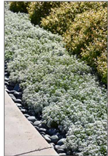
Snow Princess Alyssum in bloom

Snow Princess Alyssum is recommended for the following landscape applications;