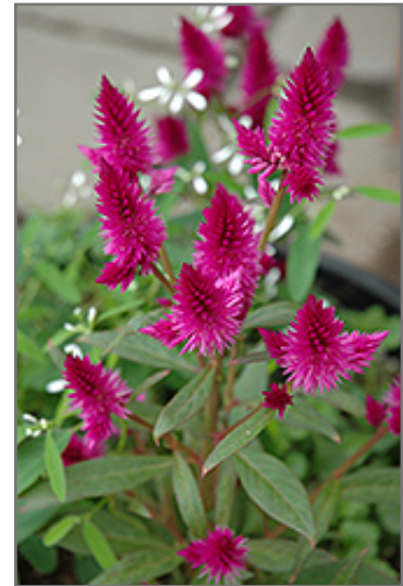
Intenz Classic Celosia flowers

Intenz Classic Celosia is recommended for the following landscape applications;