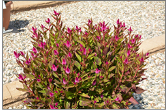
Intenz Classic Celosia in bloom

Intenz Classic Celosia will grow to be about 14 inches tall at maturity, with a spread of 12 inches. When grown in masses or used as a bedding plant, individual plants should be spaced approximately 10 inches apart. Its foliage tends to remain dense right to the ground, not requiring facer plants in front. This fast-growing annual will normally live for one full growing season, needing replacement the following year.