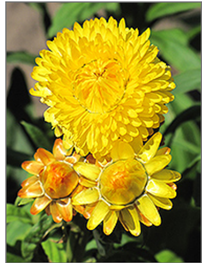
Dreamtime Jumbo Yellow Strawflower flowers