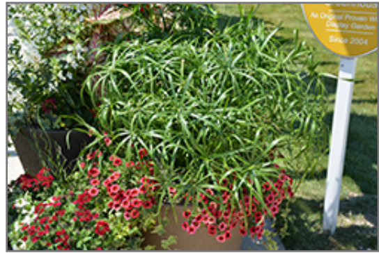
Baby Tut Umbrella Grass