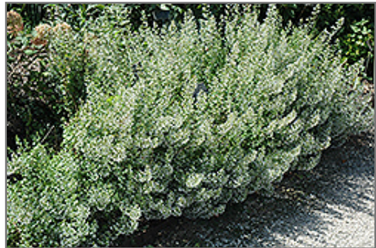
Montrose White Dwarf Calamint in bloom