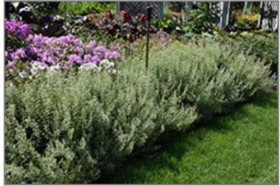
Montrose White Dwarf Calamint in bloom

Montrose White Dwarf Calamint is a fine choice for the garden, but it is also a good selection for planting in outdoor pots and containers. It is often used as a 'filler' in the 'spiller-thriller-filler' container combination, providing a mass of flowers against which the larger thriller plants stand out. Note that when growing plants in outdoor containers and baskets, they may require more frequent waterings than they would in the yard or garden. Be aware that in our climate, most plants cannot be expected to survive the winter if left in containers outdoors, and this plant is no exception. Contact our experts for more information on how to protect it over the winter months.