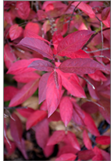
Henry's Garnet Virginia Sweetspire in fall

This shrub performs well in both full sun and full shade. It is an amazingly adaptable plant, tolerating both dry conditions and even some standing water. It is not particular as to soil type or pH. It is somewhat tolerant of urban pollution. This is a selection of a native North American species.