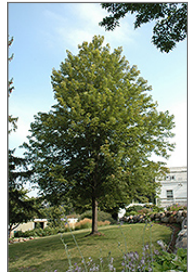
Celebration Maple