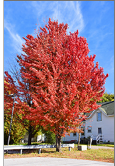
Celebration Maple in fall