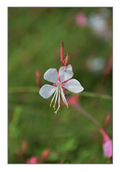
Butterfly Gaura flowers