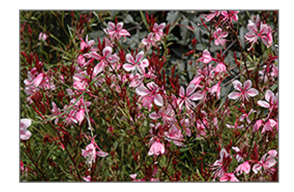
Butterfly Gaura flowers

7 S. 23rd Street Fort Dodge, IA 50501 515-955-2431 www.smittyslawnandlandscape.com