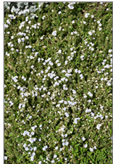
Snowmass Blue-Eyed Veronica in bloom