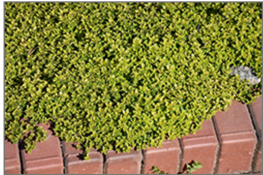
Archer's Gold Thyme

Archer's Gold Thyme's attractive tiny fragrant round leaves remain chartreuse in color with hints of yellow throughout the year on a plant with a spreading habit of growth.