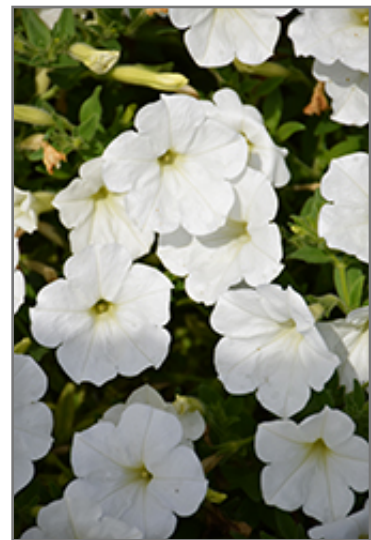
ColorRush White Petunia flowers