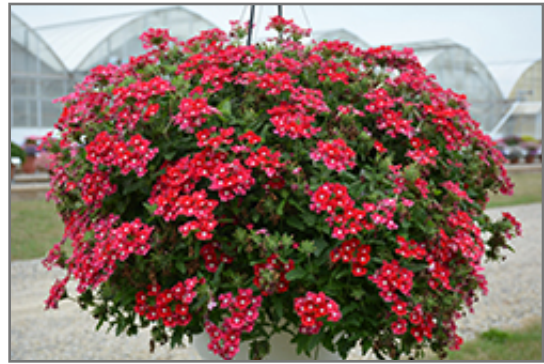
Cadet Upright Red Verbena in bloom

Cadet Upright Red Verbena will grow to be about 10 inches tall at maturity, with a spread of 14 inches. When grown in masses or used as a bedding plant, individual plants should be spaced approximately 10 inches apart. Its foliage tends to remain low and dense right to the ground. This fast-growing annual will normally live for one full growing season, needing replacement the following year.