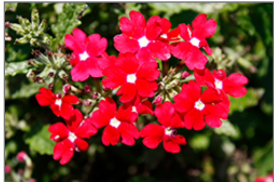
Cadet Upright Red Verbena flowers

Cadet Upright Red Verbena is recommended for the following landscape applications;