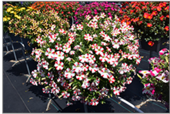
Amore King of Hearts Petunia in bloom

Amore King of Hearts Petunia will grow to be about 12 inches tall at maturity, with a spread of 14 inches. When grown in masses or used as a bedding plant, individual plants should be spaced approximately 10 inches apart. Its foliage tends to remain dense right to the ground, not requiring facer plants in front. This fast-growing annual will normally live for one full growing season, needing replacement the following year.