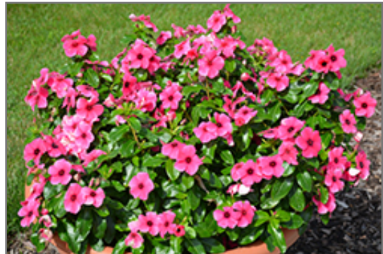
Tattoo Raspberry Vinca in bloom