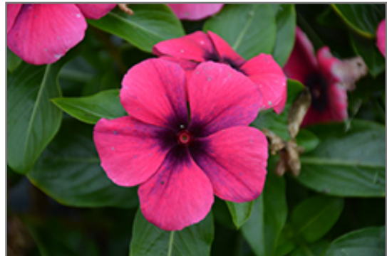
Tattoo Raspberry Vinca flowers

This plant will require occasional maintenance and upkeep, and should not require much pruning, except when necessary, such as to remove dieback. It is a good choice for attracting butterflies to your yard, but is not particularly attractive to deer who tend to leave it alone in favor of tastier treats. It has no significant negative characteristics.