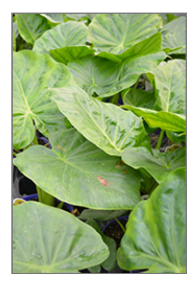
Calidora Elephant's Ear foliage

Fort Dodge, IA 50501 515-955-2431 www.smittyslawnandlandscape.com