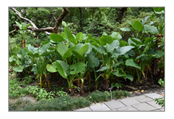
Calidora Elephant's Ear